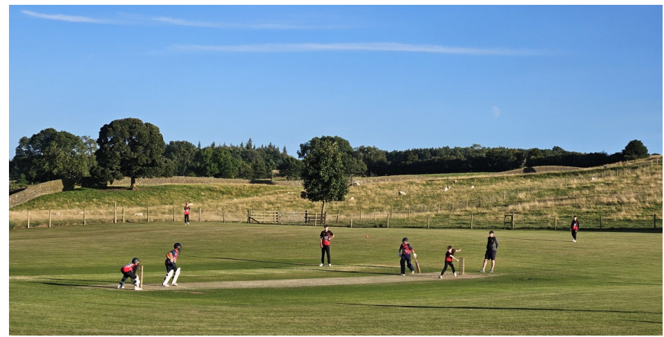
Sedgefield Cricket Club's U13 boys in action, away at one of the region's many scenic grounds