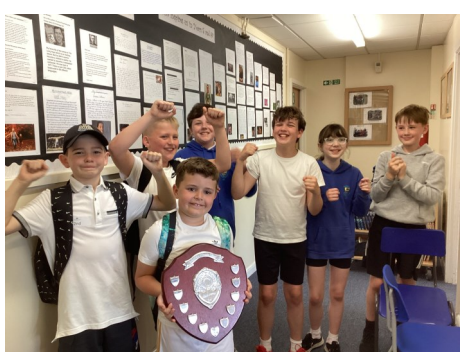
Jaguars were our school family group overall Sport's Day Shield winners for 2024.

At Sedgefield Primary we value sports and believe all pupils can find an area of physical activity which they can succeed in. Competing in sports is a significant part of school life. Recently several of our pupils represented our school in County Athletics. Our district came second overall with several of our pupils becoming medal winners! Sports Week was a huge success this year and offered a huge variety of activities to suit all pupils. Events included a whole school water fun day. This event was a highlight for many pupils which included the water walk of faith. Sport's week also included a wheelie fun day where pupils brought bikes and scooters to take part in a series of challenges as mini obstacle courses covered the school yard. We had each class taking part in a penalty shootout/crossbar challenge - where we found out who was the champion for each year group. A further event was a Wimbledon challenge to test the children's tennis skills. A Just Dance afternoon tested pupils dance steps. One day event was a hula hoop challenge. This involved team games with a hula hoop to seek out our hula hooping champions. A different themed warmup each morning with the parents commenced each active day for the week.