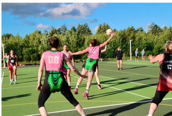
Liberty Park Netball Team in action

Liberty Park Netball Club has returned to Sedgefield and hopes to bring together women of all ages to celebrate fitness, teamwork, and community spirit. The club was founded in 2019 by a group of enthusiastic women with a shared love for the game. Over the years, it has grown significantly and now boasts three adult teams, playing across divisions 1-3 of the Durham Netball League. After a short stint on Sedgefield's outdoor courts during the Covid-19 restrictions, Liberty Park has finally returned to Sedgefield to make its home at Sedgefield Community College. The netball season runs from September to August and the last one was particularly exciting for Liberty Park. The first team won division 1 of the Durham League in both winter and spring, while the second and third teams cemented their positions in divisions 2 and 3 respectively. Liberty Park Netball Club welcomes new members, whether you're an experienced player or a complete beginner. The club offers a weekly training session and members can also join one of the teams and compete in matches.