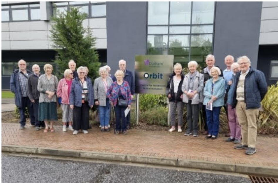
Recent trip by the u3a Science and Industry Group

With the advent of winter and the loss of the Winter Fuel Payment, older residents may be looking for ways in which to keep warm and active. Fortunately, we live in Sedgfield and there is a wide range of activities aimed at the older person to fill your days. At your first visit to any of these groups, you may not know anyone but, I'd like to guarantee that you will have made at least one new friend by the time you leave!