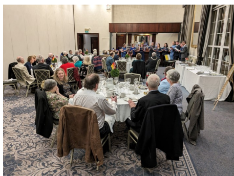
Enjoying a performance from Lirica