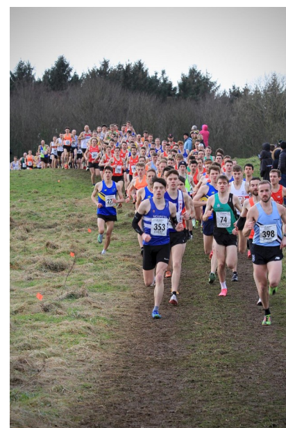
The lead pack in the senior men's event at the 2024 Northern Cross Country Championships

The club is already preparing for its end of season awards night, which will be held on Saturday 6 April. More details will be revealed in due course. Find out more about Sedgefield District RUFC on the club's Facebook page at facebook.com/sedgefield.districtrufc and on its website at pitchero.com/clubs/sedgefielddistrictrufc .