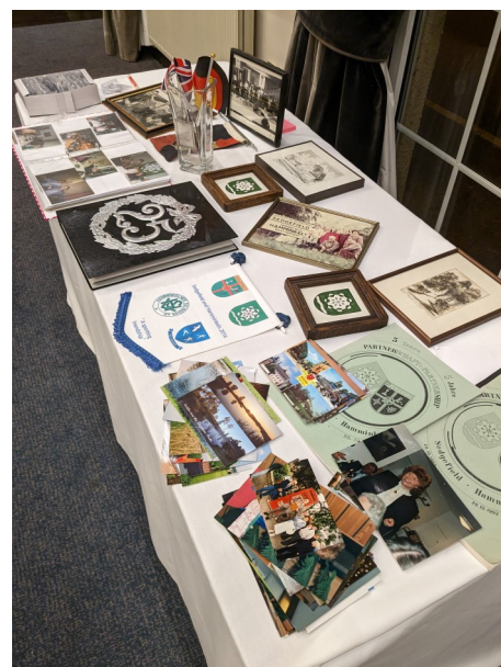
Memorabilia from 40+ years of twinning