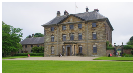
Ormesby Hall

With our new-found grant money, several groups have been organising and finalising trips out of the village. The Lunch Group will be going to Middridge, the Theatre group are to productions at Newcastle Theatre Royal and at Billingham Forum, and the Homes and Gardens group are to visit Ormesby Hall. Many more trips and visits are currently being planned. Hopefully we'll have a long, warm summer to take advantage of them.