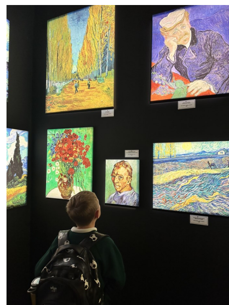
The immersive gallery

The highlight of the visit was undoubtedly the immersive gallery, where the pupils walked through floor-to-ceiling projections of Van Gogh's most famous works. The room was filled with the vibrant colours and bold brushstrokes that characterize the artist's style, allowing the children to feel as if they had stepped into the paintings themselves and link the techniques they had been taught in school when learning about Van Gogh.