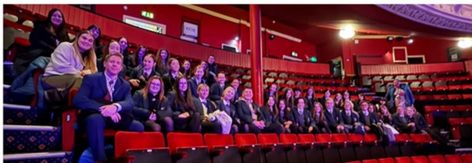
Our 'Sister Act Junior' cast enjoying a performance of the show.