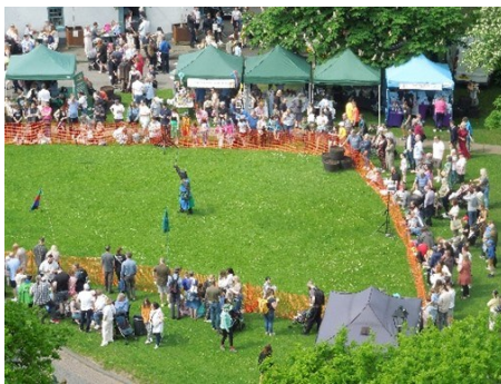
Sedgefield Mediaeval Fayre 2024

SCA is delighted to continue to run this very popular, annual event. SCA is pleased to support local brewers, and there will be a wide (up to 18 beers) selection of new and established ales (raffle tickets £2 each for a half pint) which will include the ever-popular Jaipur and two ciders; the community bar will also be open. There will be a BBQ for burgers and hot sausage buns, both nights. The entertainment on Saturday night (starting at 8pm) is provided by popular local band, Mamma Said. Anyone wishing to help serve on the festival bar, collecting/washing glasses, or helping with the BBQ, please contact Tony on 07484279427 or email info@sedgefieldsca.org.uk .