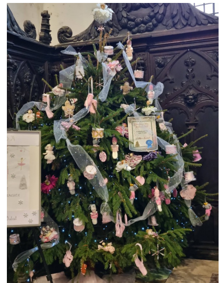
Joint community winner - U3A