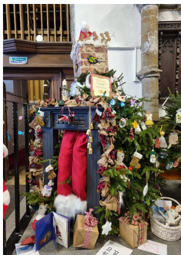
Local Business winner - From Loft to Loved