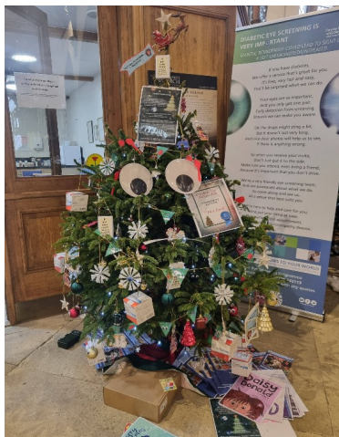
Joint community winner - Darlington & County Durham Diabetic Eye Screening team