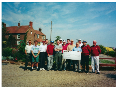
Golf Society - the early days