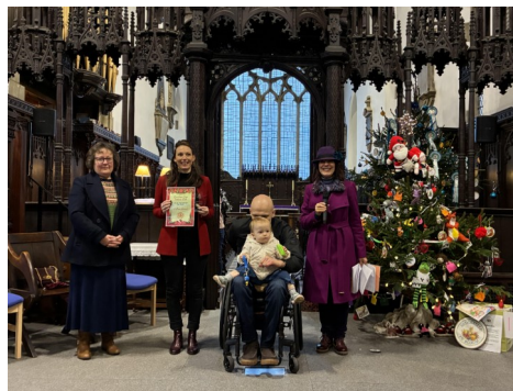
From Loft to Loved receiving their award