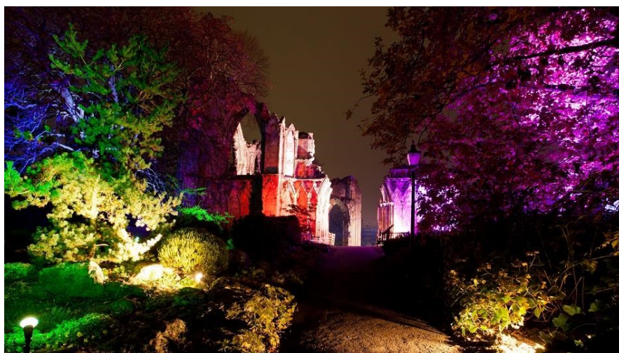
AGLOW at Auckland Palace

See wildlifetrusts.org/news/free-beaver-new-vision-beavers-england-and-wales for more information.