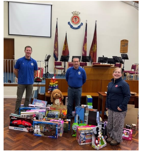
SDUSG deliver toys to the Salvation Army at Sherburn Hill for their Christmas Appeal

If you would like to join the group, please visit our Facebook page SVVeterans and send us a message or email us at sdusgexec810147@groups.outlook.com and we'll get back to you as soon as we can.