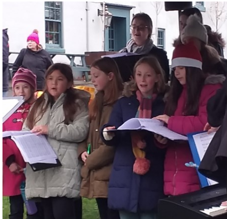
Both choirs performing beautifully at December's Farmers' Market, helping to ensure market goers had a merry little time whilst they shopped

Back in 1985, Sandy Clubley and other Sedgefield Lyric Singers had the fantastic idea to set up a youth choir. Our Youth Choir (SLYC) met for the first time on Friday 18 January 1985 and is still going strong today! 2025 is our 40th Anniversary and we would love to celebrate with people who have been involved with SLYC over the years.