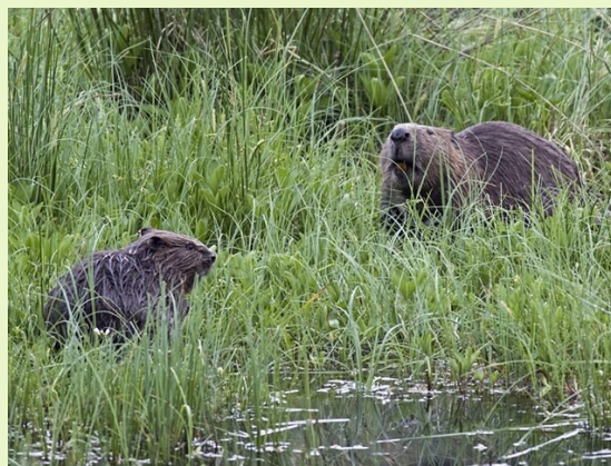
Eurasian beaver mother and kit

In Europe, the beaver has made a comeback and there are now over 1.6 million spread around the mainland resulting from reintroductions, natural colonisations and strict protection. Scotland has licensed several beaver releases and now has many sites with active beaver populations. There have been various trials around Britain, results are not problem free, but issues are not unsurmountable helping