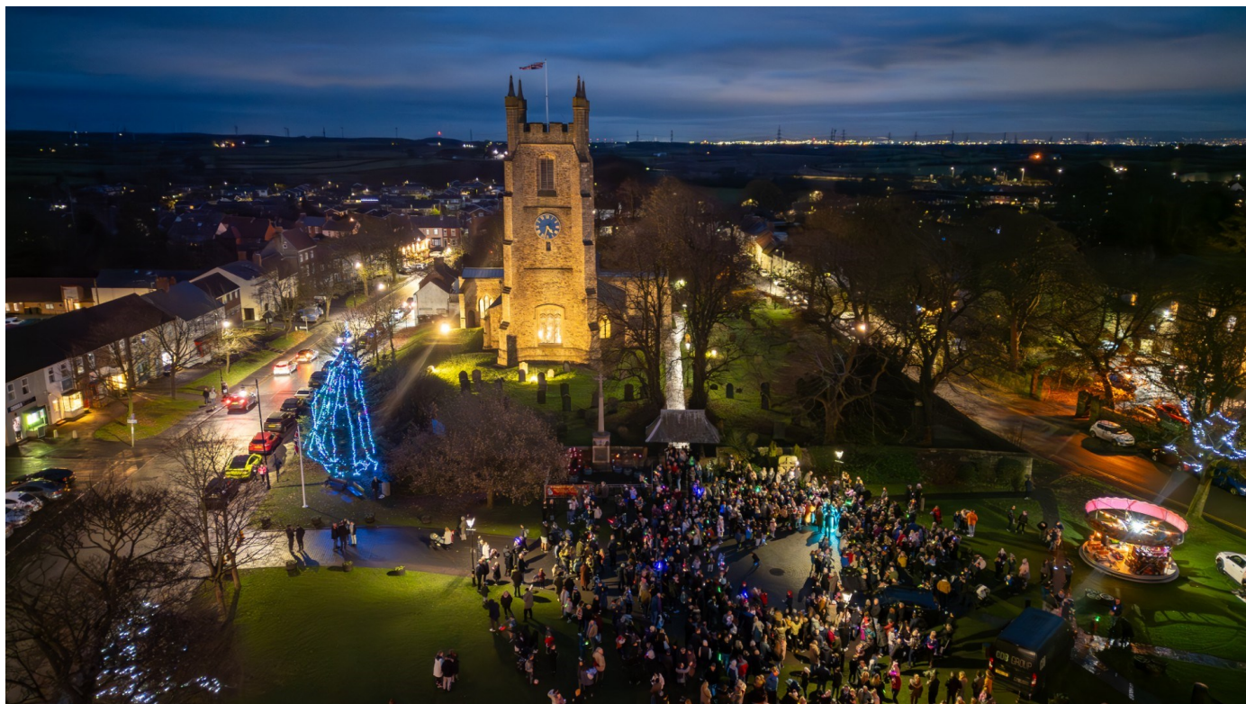
The Christmas light switch on at Sedgefield's Snow Party.

Wishing all our readers a very happy New Year