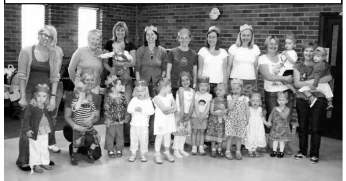
The Wigglets Tuesday 9.30am class - with their party hats on!

Line Dancing is at the usual time of 12.00 in the Parish Hall, before the 'party'.