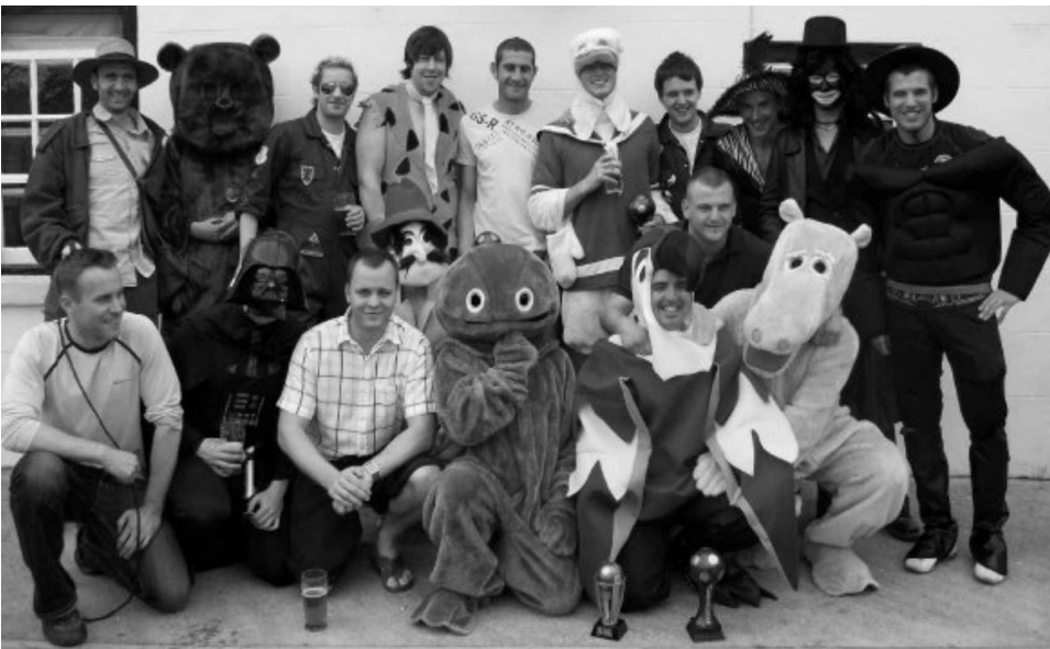
As they opened the kit bag at their next game, Crosshills FC started to doubt the wisdom of signing a sponsorship deal with a fancy dress outfitter.